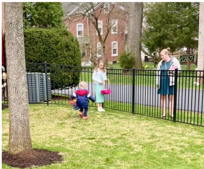
Easter Egg Hunt before worship on Easter Sunday